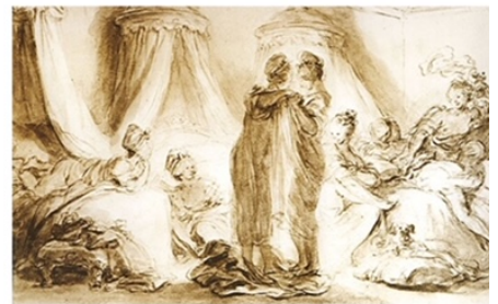
Le coucher des ouvrières, a wash painting using Bistre pigment by Jean-Honoré Fragonard (1732-1806)

The use of single tones (monochrome) goes back to pre-history, artists using charcoal, soot, or natural earth pigments (umber).