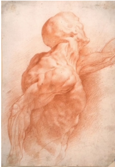
Anatomical study (1607) by Peter Paul Rubens

Welcome to our next Adventure in the F series.