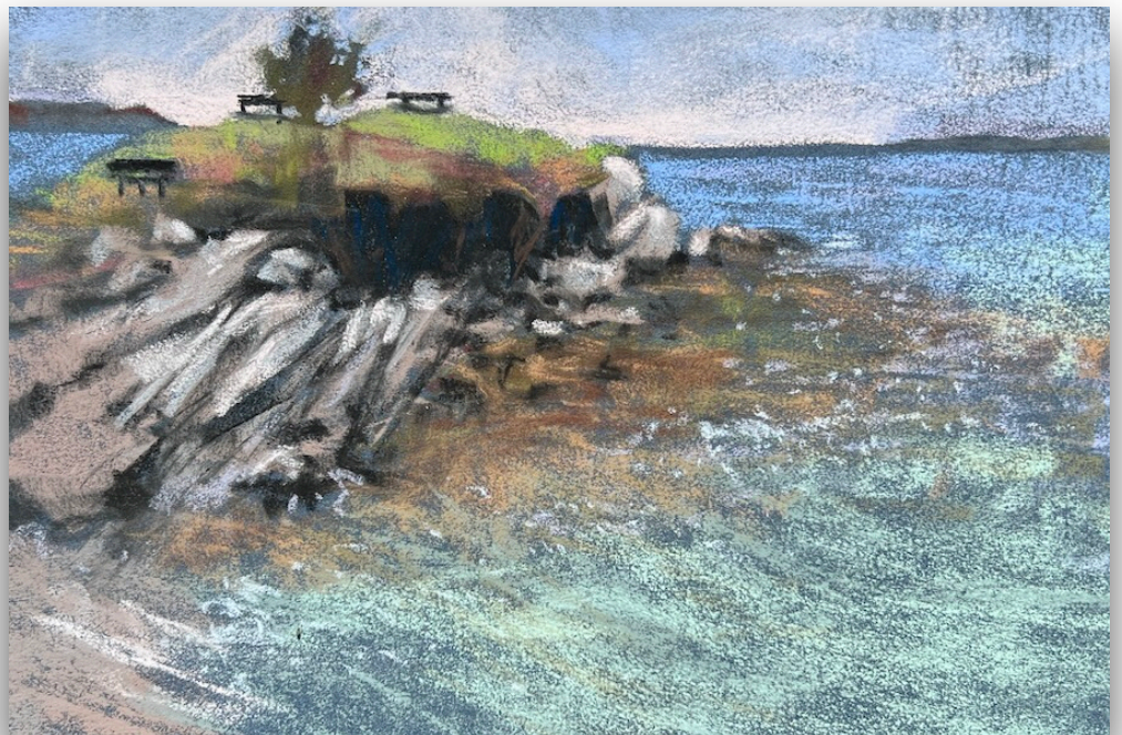
"A Place to Ponder" 9x11" on PastelMat

I'm in Maine, but still got out to do some plein air painting. It had been a bit of a rough day so I went to the ocean to sit and journal and sketch. Finally a small painting. I felt so much better afterward! This is Kettle Cove just outside Portland as the tide was going out. The color of the water was interesting as it was different in each area. Nearby it had seaweed floating on top so there was layering of some interesting colors. The dark blue/grey paper was an element in the composition and really helped unite the painting.