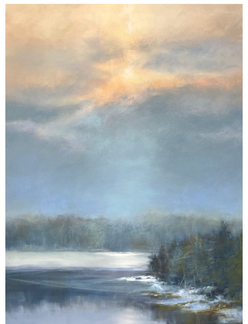
Before the Spring Thaw

Painting a landscape is more than just trying to copy what you see, whether you’re working en plein air or in the studio. It’s a way to invite your viewer to experience a place in the way you’ve experienced it. A good landscape painting has three important elements that all enable you, the artist, to communicate with your viewers: composition, color, and clarity. These are the tools you’ll need to make each landscape unique, to give it a voice of its own. This demo and workshop will give you the opportunity to explore what it’s like to paint with intention so you can start making those important connections between your painting and its audience.