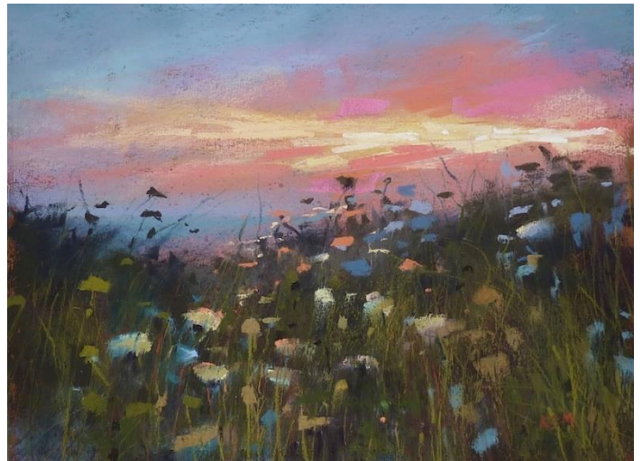
"After the Storm"

"It has been said that as artists we are either moving toward or away from abstraction. No matter where we fall on this journey, we can all benefit from ideas to help us create more expressive paintings. I am always striving to interpret my subject by including my own personal touch rather than copying the reference or painting exactly what I see. On day one of the workshop I will share some of the ways I have discovered that help me paint in a more expressive 'loose' manner. I will introduce a simple method for a successful pastel painting from the planning stage to the addition of those final important spices! On the second day we will explore the use of underpaintings and how they contribute to more expressive pastel paintings. I will